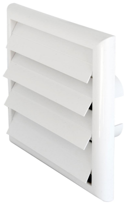
“SU1818B” grille with pressure-relief flaps