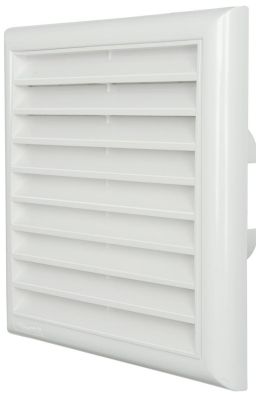
“GU1818B” grille with rainproof flaps